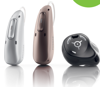
Infinio Ultra R, Infinio Ultra Sphere, Virto R Infinio

Join us at our The very best. For you. Event